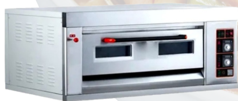
Pizza Oven 1 Deck 4 Tray

Size 1310x850x1680mm Chamber Size : 870x665x185mm Tray Size 600x400 Temp. Range 25-400°C Power : 0.225kw