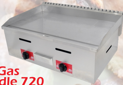
Gas Griddle 720