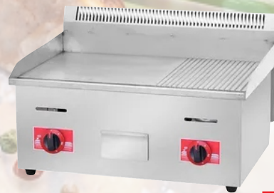
Gas Griddle 722