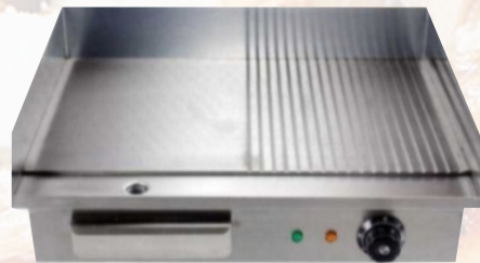
Electric Griddle 818B