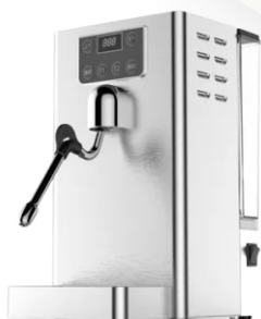
Steam Maker CS 1207

Power - 1650W Voltage/Hz - 220V /50Hz N.W /G.W - 7.2KG / 8.7KG Unit - 310*220*381mm