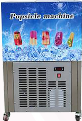
Batch Popsicle Machine

Size : 570x460X900mm Temperature -35° C Weight 60KG Capacity 50Pcs/Batch Refrigerant R22/320G Power 1200W