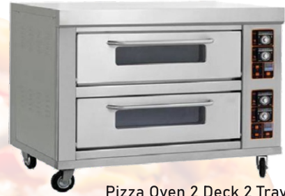
Baking Oven 2 Deck 4 Tray

Pizza Oven 2 Deck 2 Tray Size 1310x850x1400mm Chamber Size : 870x665x185mm Tray Size 600x400 Temp. Range 25-400°C Power : 0.075kw