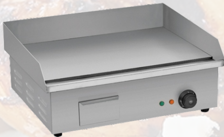
Electric Griddle 818