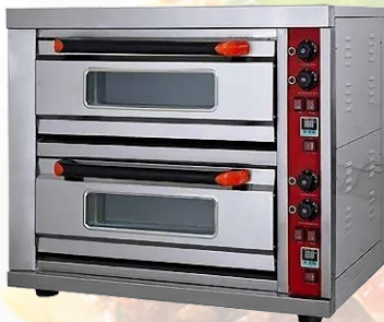
Pizza Oven 2 Deck 2 Tray

Pizza Oven 2 Deck 2 Tray Size 930x630x700mm Stone Size : 483x365x2mm Temp. Range 20-350°C Power : 6.6kw