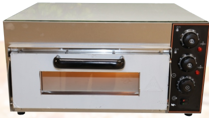
Pizza Oven Small Single

Size 560x570x280mm Stone Size : 400x400mm Temp. Range 20-350°C Power : 2kw