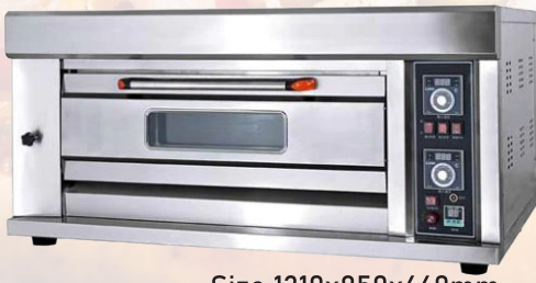
Pizza Oven 1 Deck 2 Tray

Pizza Oven 2 Deck 2 Tray Size 1310x850x1400mm Chamber Size : 870x665x185mm Tray Size 600x400 Temp. Range 25-400°C Power : 0.075kw