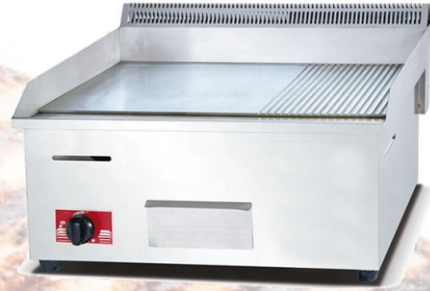
Gas Griddle 718B