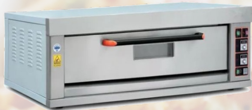
Pizza Oven 1 Deck 3 Tray

Size 1770x890x1230mm Chamber Size : 1300x650x215mm Tray Size 600x400 Temp. Range 25-400°C Power : 0.0.1kw