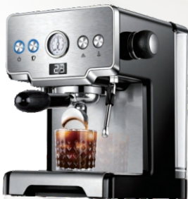
Coffee Machine CS3605

Power - 1450W Voltage/Hz - 220V /50Hz N.W /G.W - 4.2KG / 6.4KG Unit - 286*230*315mm