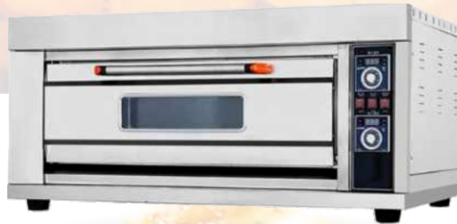
Pizza Oven 1 Deck 2 Tray

Size 1220x820x575mm Stone Size : 860x640x230mm Temp. Range 20-350°C Power : 6.6kw