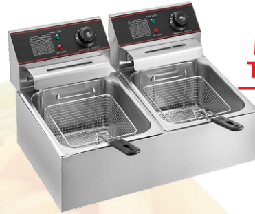
Electronic Double Tank Fryer-6+6 Ltr.

Size 290x460x310mm Capacity 6 Ltr. Power : 2.5kw