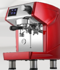
Coffee Machine CS3200B

Power - 1450W Voltage/Hz - 220V/150Hz N.W /G.W - 4.2KG / 6.4KG Unit - 286*230*315mm