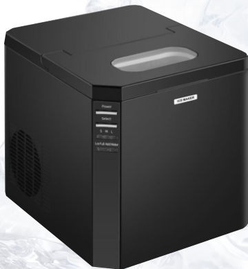
Ice Cube Maker 15kg