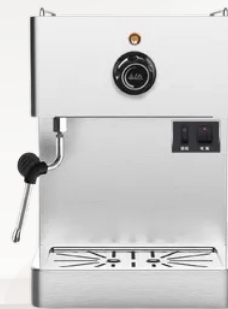
Steam Maker CS 1206

Power - 250V Voltage/Hz - 220V /50Hz N.W /G.W - 5.18KG / 6.08KG Unit 212*175*361mm