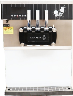
Table Top 3 Flavour

Size : 555x830X860mm Capacity 25-28 L/H Flavour 2+1 Mixed Compressor Panasonic Compressor Qty Single/Double Power : 1800/2200W. Compressor Single / Double