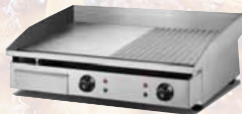
Electric Griddle 822