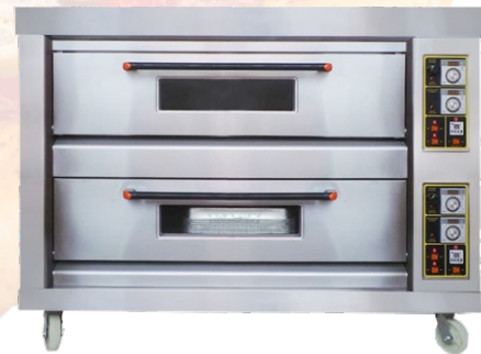
Baking Oven 2 Deck 6 Tray

Size 1770x890x1230mm Chamber Size : 1300x650x215mm Tray Size 600x400 Temp. Range 25-400°C Power : 0.0.1kw