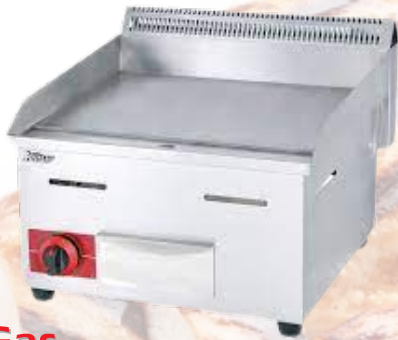
Gas Griddle 718