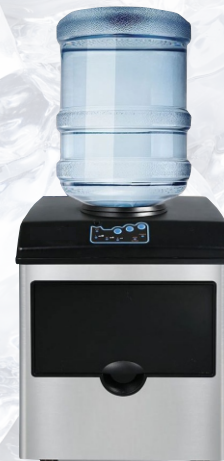
Ice Cube 15kg With Dispenser