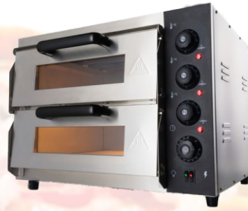
Pizza Oven Small Double

Size 560x570x280mm Stone Size : 400x400mm Temp. Range 20-350°C Power : 2kw