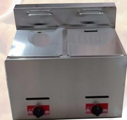
Gas Double Tank Fryer -72