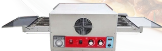
Electric Conveyor Oven

Size 1100x620x370mm Chain Size 1080x340mm Temp Range 0-400° D. Power : 6.7KW