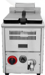
Gas Single Tank Fryer -71A