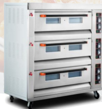
Baking Oven 3 Deck 9 Tray

Size 1770x890x1705mm Chamber Size : 1300x640x230mm Tray Size 600x400 Temp. Range 25-400°C Power : 0.3kw