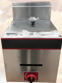
Gas Single Tank Fryer -71