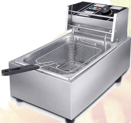
Electronic Single Tank Fryer-6Ltr.

Size 290x460x310mm Capacity 6 Ltr. Power : 2.5kw