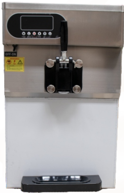
Table Top Single Flavour

Size : 475x760X780mm Capacity 18 L/H Flavour Single Compressor Panasonic Compressor Qty Single Power : 1500W.