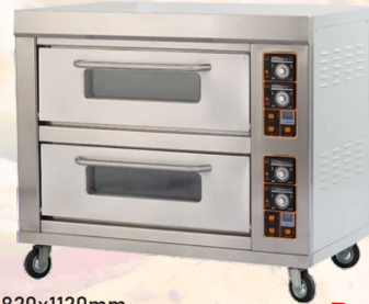
Baking Oven 2 Deck 4 Tray

Size 1220x820x1120mm Stone Size : 860x640x230mm Temp. Range 20-350°C Power : 13.2kw