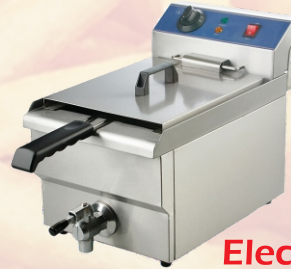
Electric Single Tank Fryer With Valve 10 Ltr.

Size 580x460x310mm Capacity 6+6 Ltr. Power : 2.5kw*2