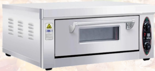
Pizza Oven 1 Deck 1 Tray

Size 560x570x440mm Stone Size : 400x400mm x 2 Temp. Range 20-350°C Power : 3kw