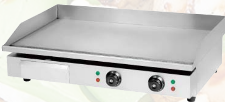
Electric Griddle 820