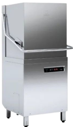
Dishwasher Hood Type