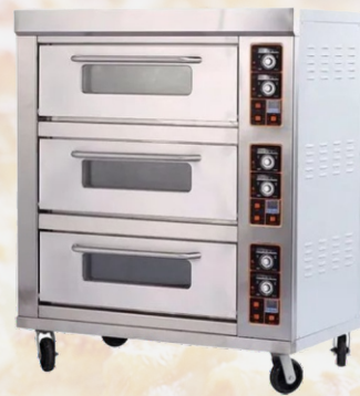
Baking Oven 3 Deck 6 Tray

Size 1310x850x1680mm Chamber Size : 870x665x185mm Tray Size 600x400 Temp. Range 25-400°C Power : 0.225kw