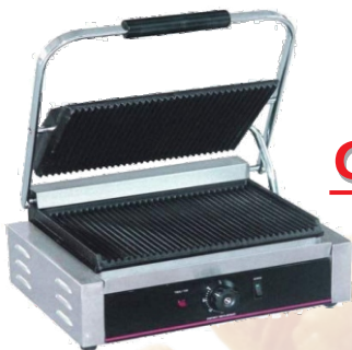
Jumbo Contact Grill