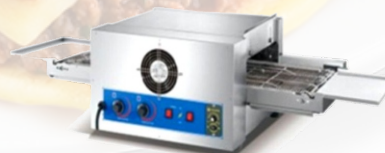
Gas Conveyor Oven

Size 1100x620x370mm Chain Size 1080x340mm Temp Range 0-400° D. Power : 6.7KW