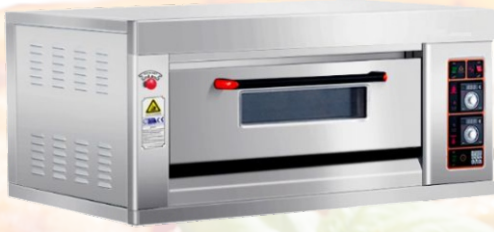
Pizza Oven 1 Deck 1 Tray

Size 1010x590x570mm Chamber Size : 460x640x185mm Tray Size 600x400 Temp. Range 20-350°C Power : 0.075kw